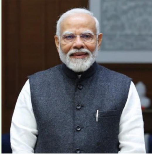
This rate is more than double the

According to the World Health Organization (WHO) India has recorded a decline of 17.7 percent in TB incidence from 2015 to 2023.