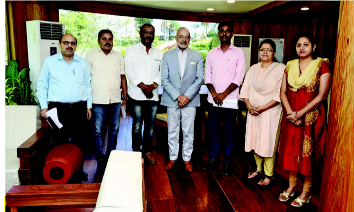
A delegation of PBMC Councillors led by Chairperson, Shri N K Udhaya Kumar, called on Admiral D K Joshi, PVSM, AVSM, YSM, NM, VSM (Retd.), Hon'ble Lt. Governor, A&N Islands and Vice-Chairman, Islands Development Agency to discuss progress of Smart City and various other projects related to Council, including the progress of ongoing/future developmental works in A&N Islands.