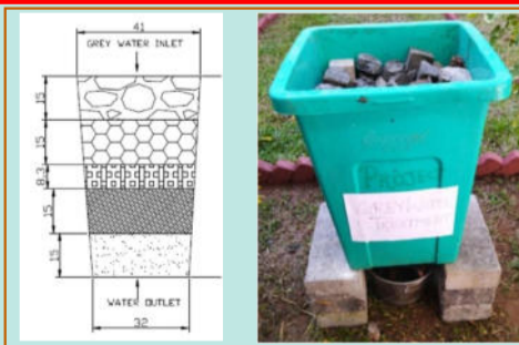
Proposed Karotar-Grey Water Treatment Unit

The A&N Islands receive copious rainfall to the tune of over 3000 mm per year, but the geographical location of the Islands in the equatorial region facilitates high rate of evaporation. Further, if monsoon is delayed, the water in the reservoirs or in the surface water bodies dries up adding to water scarcity and depletion of water sources. Paucity of favourable catchments, negative departure from the normal rainfall in succession and receding monsoon adds to curtailment of water supply especially from the springs or spring fed streams. Further, surface water as well as rain water resources could not be developed optimally due to various climatologic and environmental reasons. In addition to above, the ground water potential in the Islands has been found sub optimal due to various hydro-geological reasons.