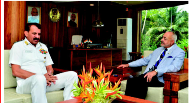
Vice Admiral Dinesh K Tripathi, AVSM, NM Chief of Personnel of Indian Navy, currently on a visit to these Islands, called on Admiral D K Joshi, PVSM, AVSM, YSM, NM, VSM (Retd.), Hon'ble Lt Governor, A&N Islands and Vice-Chairman, Islands Development Agency today at Raj Niwas.