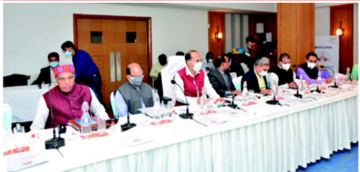
Chairman & members of Public Accounts Committee (2021-22) of Parliament is on Study Visit to A&N Islands. Held discussion with representatives of Ministry of Defence (Navy) at Bay Island on 04.01.2022.