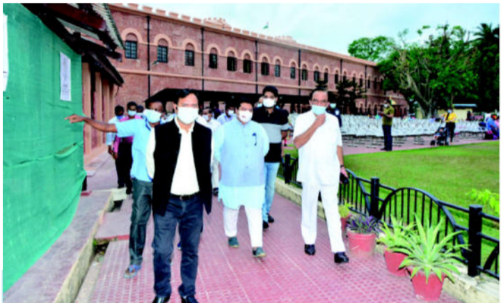
The Chairman and Members of Department related Parliament Standing Committee on Commerce currently on study visit to the Islands visited National Memorial Cellular Jail on 04.01.2022.