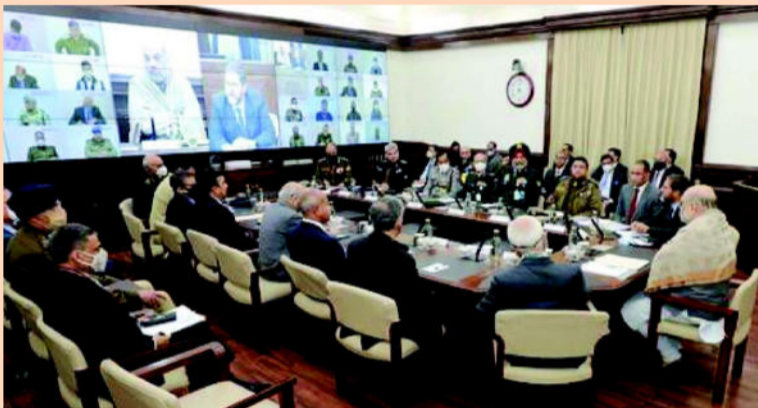
Financial Intelligence Agencies through video conferencing. Highlighting the continued threats of terrorism and global

New Delhi, Jan. 4(PIB) Union Home Minister, Shri Amit Shah conducted a high level security meeting yesterday in New Delhi to review the prevailing threat scenario in the country and the emerging security challenges. The Heads of security agencies of the country prominently Central Intelligence Agencies, CAPFs, Intelligence Wings of Armed Forces, Revenue and