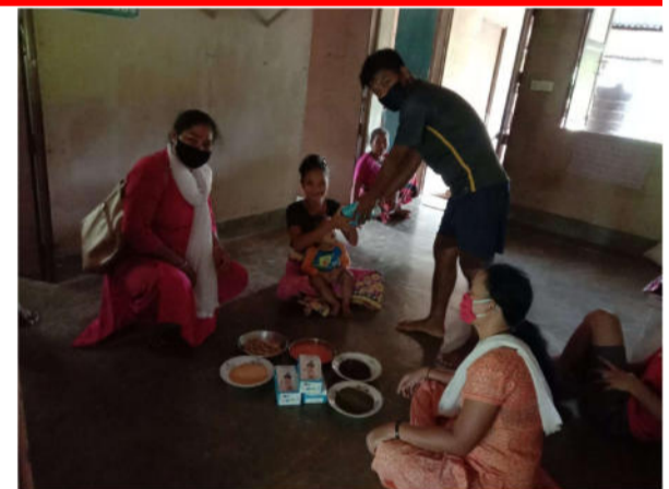
Doorstep delivery of raw ration at Kamorta Island