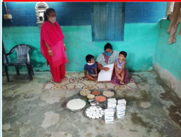
Doorstep distribution of raw ration at Campbell Bay