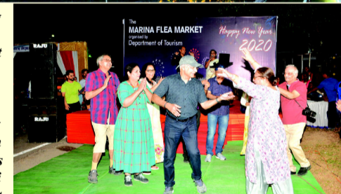
Visitors enjoying their evening, dancing to the beat of music. (more photos on last page)