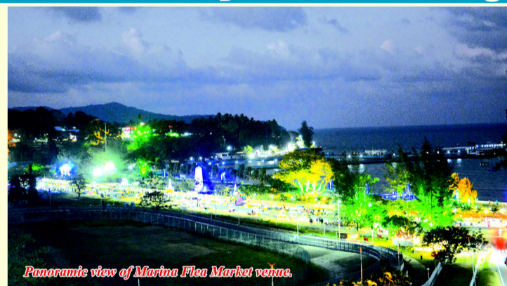
Panoramic view of Marina Flea Market venue.

Visitors were indulging in merriment at the Karaoke booth while children were busy spending their evening at the fun games corner and photo booth. The PBMC stall has been set up with the objective to create awareness among people on the importance of cleanliness, harmful impact of plastics etc. Meanwhile, Ankur-a Social and Cultural Society delighted the gathering with musical programme as a tribute to RD Burman, legendary Music Director of Bollywood, on his death anniversary today besides musical programmes by other local cultural groups entertained the visitors. The Marina Flea Market will also be open tomorrow (Jan 5) from 5 pm to 10 pm.