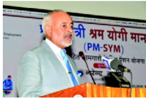
Port Blair, Mar 5