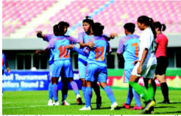
Mandalay (Myanmar), April 4

In Football, the Indian women's national team today registered a 2-0 win over Indonesia in its opening match of the Olympic Qualifiers Round two in Mandalay, Myanmar.