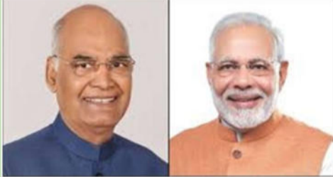
Ministry of Education, Govt. of India.

The President of India, Shri Ram Nath Kovind and Prime Minister, Shri Narendra Modi shall address the inaugural session of the Governors' Conference on National Education Policy at 10.30 am tomorrow (Sept. 7) through video conference. The Conference titled 'Role of NEP-2020 in Transforming Higher Education' is being organized by the