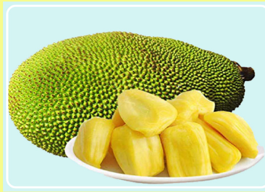
constipation, treat nervousness, help prevent obesity and lowers blood pressure. It is also an anti-oxidant. Source: NDTV food

Jackfruit is a tree native to Southeast Asia. The fruit has a spiky green covering with white flesh inside. It is considered to be the largest tree borne fruit. The seeds of the fruit are taken from the ripe fruit and then dried for use in either in curries or as part of roasted snacks. The seeds of jackfruit which are big oval shaped and have a milky taste are often prepared by themselves. The fruit is known for its distinct sweet and fruity aroma. The flesh is starchy and fibrous. Jackfruit seeds taste like chestnuts and may even be preserved in syrup likewise. The roasted seed is also ground to make a flour blend with wheat for baking. It is mostly used in South and South East Asian cuisines. It is eaten cooked. They turn brown and rancid very quickly. They should be refrigerated. Fruity goodness! It contains calories but no cholesterol and saturated fats. It is rich in anti-oxidants and is known to provide instant energy. Even the seeds of this fruit have a lot of benefits. They help prevent