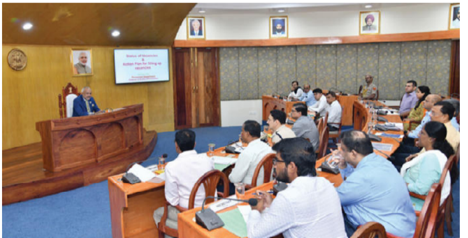
Admiral D K Joshi, PVSM, AVSM, YSM, NM, VSM (Retd.), Hon'ble Lt Governor, A&N Islands and Vice-Chairman, Islands Development Agency reviewed the series of steps taken by Andaman & Nicobar Administration for filling up of vacant posts in A&N Islands today at Raj Niwas. Directed to ensure the focus on accomplishing the target of recruitment by September, 2023.