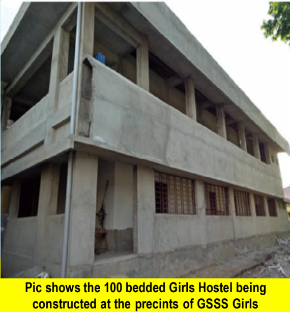
Pic shows the 100 bedded Girls Hostel being constructed at the precincts of GSSS Girls

Port Blair, July 1 With the objective to ensure that girl students are not denied the opportunity to continue their studies due to distance to schools, parents financial affordability and other societal problems, the Education Department is in pursuit of establishing Girls' Hostel at prominent locations of the Islands to encourage girls in accomplishing their formal schooling at all levels. In this direction, a 100 Bedded Girls' Hostel is being constructed at the premises of Govt. Girls Sr. Secondary School, Port Blair. Block-I of this Hostel comprising of 40 bedded capacity has already been completed whereas Block-II of 60 bedded capacity at an estimated cost of Rs.2.87 crore is on the verge of completion. The finishing works are being carried out and is expected to