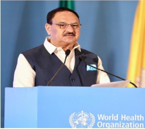
World Health Organization

New Delhi, Oct.7 Union Health Minister, Shri Jagat Prakash Nadda today said that "India's health system embraces a "whole of Government" and "whole of society" approach to achieve Universal Health Coverage (UHC), with emphasis on strengthening primary healthcare and essential services." Addressing the 77 th session of the World Health Organization (WHO) Southeast Asia Region, the Minister said that the Government's Ayushman Bharat-Pradhan Mantri Jan Arogya Yojana has covered over 120 million families and provided an annual hospitalization benefit of 6,000 dollars per family.