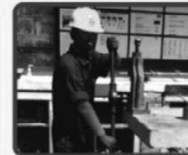
Formwork Carpentry Trade