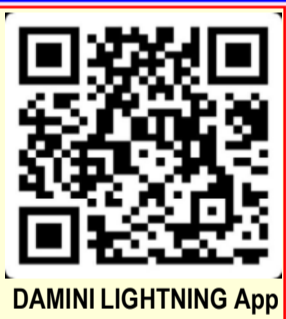
DAMINI LIGHTNING App

mobile applications have been developed. MAUSAM, a Mobile App of the India Meteorological Department (IMD) is providing seamless and user-friendly access to weather products available on https://mausam.imd.gov.in/ .