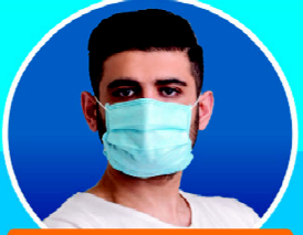
Wear your mask properly