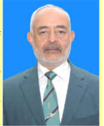
(Admiral D K Joshi)

Let us reaffirm our pledge to ensure an environment of safety & due respect for women for safeguarding our society, Islands and the Nation.