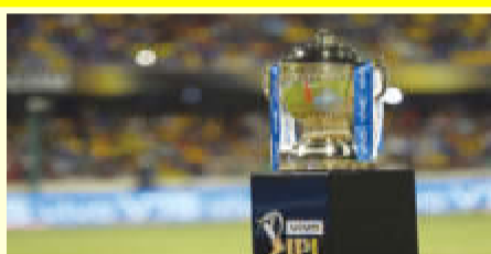
Largest Cricket Stadium - Narendra Modi Stadium in Ahmedabad will host the Playoffs as well as the final on 30 th May which promises to be a visual spectacle. All matches will be played at neutral venues, no team will play at their home venue. All teams will play at 4 out of 6 venues during the league stage.

The Premier League will get underway from April 9 with defending champion Mumbai Indians taking on Royal Challengers Bangalore at the MA Chidambaram stadium in Chennai. The World's Largest Cricket Stadium - Narendra Modi Stadium in Ahmedabad will host the Playoffs as well as the final on 30 th May which promises to be a visual spectacle. All matches will be played at neutral venues, no team will play at their home venue. All teams will play at 4 out of 6 venues during the league stage.