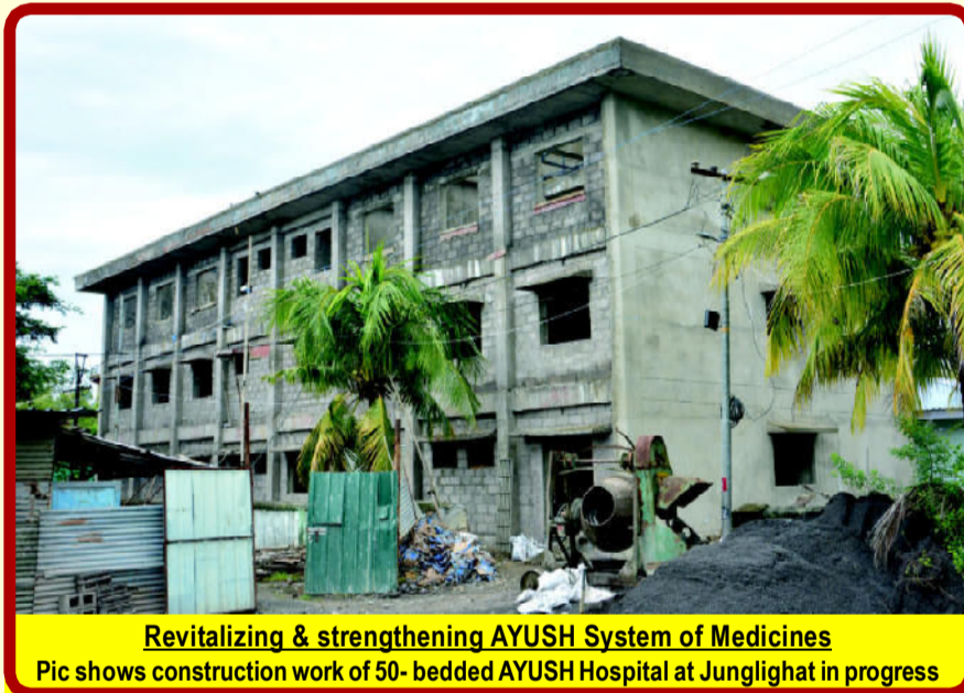
Revitalizing & strengthening AYUSH System of Medicines Pic shows construction work of 50- bedded AYUSH Hospital at Junglighat in progress

Presently, apart from the existing AYUSH hospital at Junglighat, two Panchakarma Centers, 19 Homoeo Dispensaries, 13 Ayurveda Dispensaries and 6 Yoga Wellness Centers co-located at various DHs, CHCs, and PHCs are providing services to the general public across the Islands. In addition to the regular OPD care, AYUSH units carry out a range of field activities including free health camps, Poshan camps, Yoga classes, awareness meetings at community level for preventive, promotive and curative health