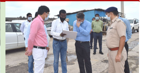
Principal Secretary inspects soil erosion at Mus Jetty