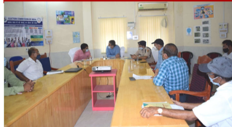
Principal Secretary holds meeting with Tribal Council & Line Departments in Car Nicobar