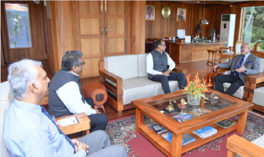
Unit (CANSRU) developing A&N Ship Building agreement for Islands as Regional Repair Hub.

Hon'ble Lt. Governor emphasized the need to expedite the Detailed Project Report (DPR) for modernization of Marine Dockyard and overall ship repair ecosystem in the Islands. Hon'ble Lt. Governor also urged to constitute emergency repair team to handle urgent short repairs & develop ancillary industries at Sri Vijaya Puram, set up partnerships with Original Equipment Manufacturers (OEMs) & competent agencies for specialized repairs at Marine Dockyards, a press release from Raj Niwas said.