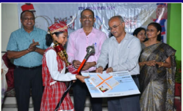
at Govt. Boys' Sr. Sec. School to select the Best School Band both under Boys and Girls categories to represent the UT at

To inculcate the spirit of patriotism and unity among school students, the Department of School Education and Literacy, MoE, GoI is organizing School Band Competition throughout India. The State Level School Band Competition was organised by Samagra Shiksha, UT Mission, A & N Islands today