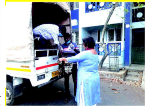
Doorstep distribution of milk by ANIIDCO