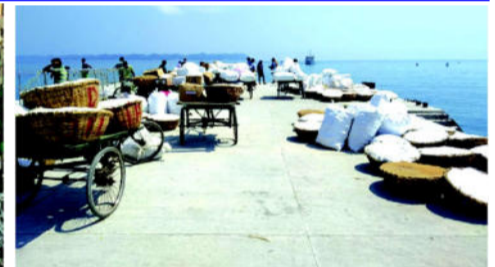
Consignment of vegetables from Shaheed Dweep reaching Port Blair