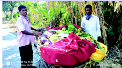
Mobile vending of vegetables in Diglipur, N&M Andamans

On an average, 3250 kg of fresh vegetables are