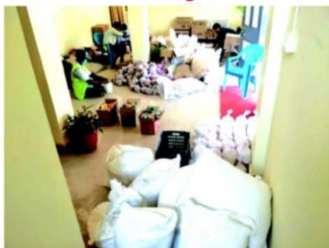
Relief kits distributed at Mannarghat

beneficiaries. The items of the relief kit included 5 kg rice, 2 kg atta, 1 kg each of onion, potato, sugar, dal, besides 1 litre oil and other food items. The Pradhan has also thanked all the volunteers for their monetary contributions and for helping in distribution of the relief kits, a communication said.