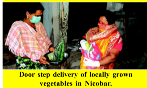
Door step delivery of locally grown vegetables in Nicobar.