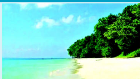
The mapping of the strategic archipelago is proposed to be done by Indian National Centre for Ocean Information Services and National Remote Sensing Centre through Airborne LiDAR Terrain Mapping (ALTM)

India plans to conduct airborne radar surveys to map the surface topography of Andaman & Nicobar Islands, Minister of State (Independent Charge) for Science and Technology and Earth Sciences Ministry, Dr. Jitendra Singh said in a reply to Lok Sabha on Friday. This mapping of the strategic archipelago is proposed to be done by Indian National Centre for Ocean Information Services (INCOIS) and