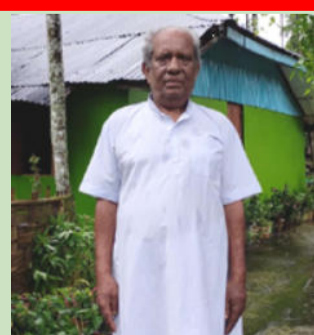
heart disease has recovered from COVID-19. He was having fever (Contd. on last page)