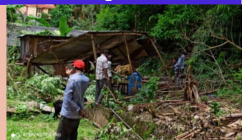
during the eviction drive. Similarly, the Tehsil Office, Ferrargunj has removed (Contd. on last page)

The Tehsil Office, Port Blair conducted eviction drives at Radha Nagar area of Swaraj Dweep by restoring an area of 6700 sqmts. of Govt Land while at Ramnagar area of Saheed Dweep area of 600 sqmts. of Govt Land has been restored. In South Point village, an area of 200 sqmts. of Govt Land has been restored